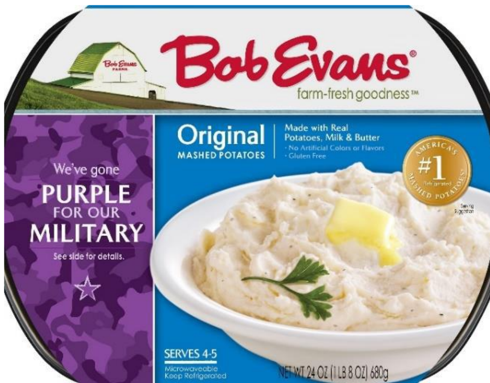
Id. ¶ 4.

restaurants—as refrigerated, ready-to-eat products. Id. ¶¶ 1–2. The Mashed Potatoes’ packaging contains several statements, including, on the packaging for the Original product, “Made with Real Potatoes, Milk & Butter.” Id. ¶ 4. Each variety’s packaging also says “farm-fresh goodness” toward the top, directly below the Bob Evans logo. Id. The packaging for the Original variety depicts an image of the Mashed Potatoes in a bowl, topped with a pat of melting butter and labeled “Serving Suggestion[.]” Id. ¶¶ 6–7. The backs of some of the varieties’ packaging state “Made with Real Milk & Butter” and either “Made with Fresh Potatoes” or “Made with 100% Fresh Potatoes[.]” Id. ¶ 5. The Mashed Potatoes’ back packaging also states the products’ nutrition facts and ingredients. ¶ 8. Thus, the front packaging for the Original product appears as follows: